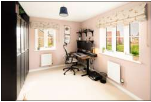
First Floor Bedroom Four