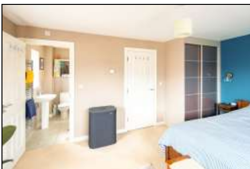
Second Floor Bedroom One