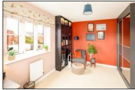
First Floor Bedroom Four