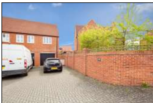
Garage and Parking