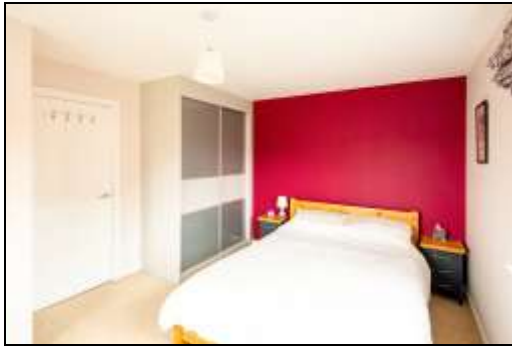
First Floor Bedroom Three