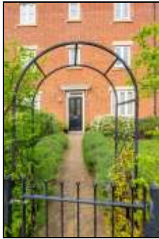
Front Gate and Side Elevation