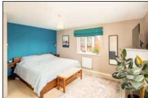
Second Floor Bedroom One