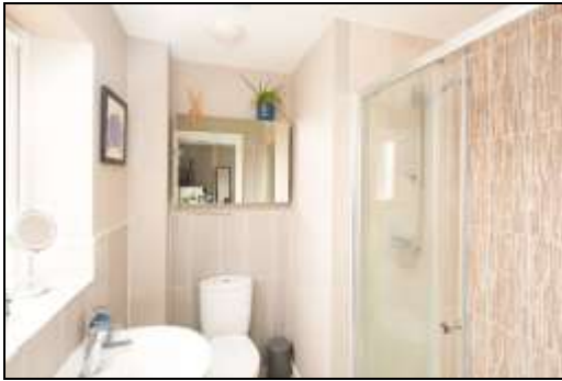
En-Suite to Bedroom One