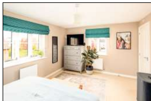
Second Floor Bedroom One