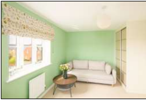
Second Floor Bedroom Two