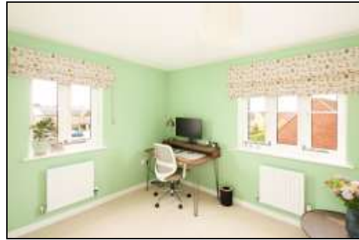
Second Floor Bedroom Two