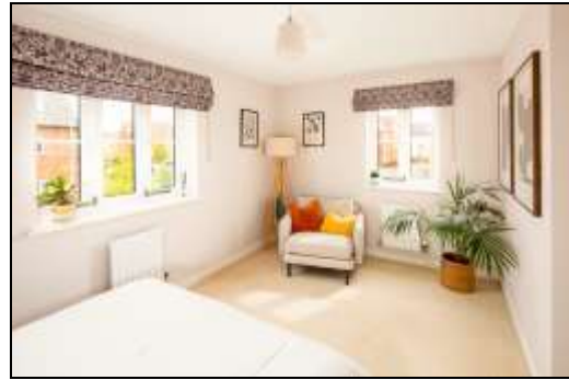
First Floor Bedroom Three