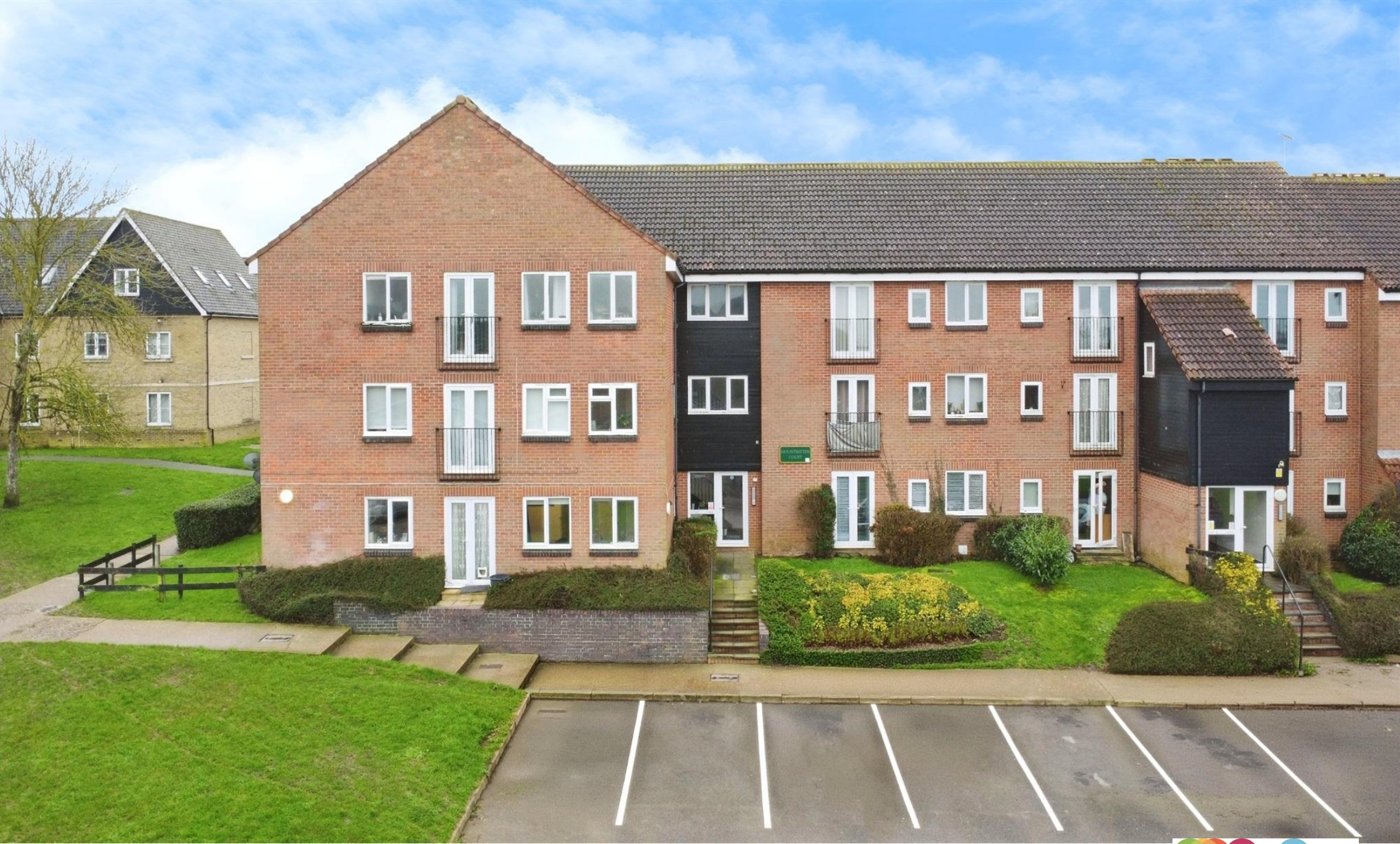
Mountbatten Court, Mountbatten Road, Braintree, CM7 9UL