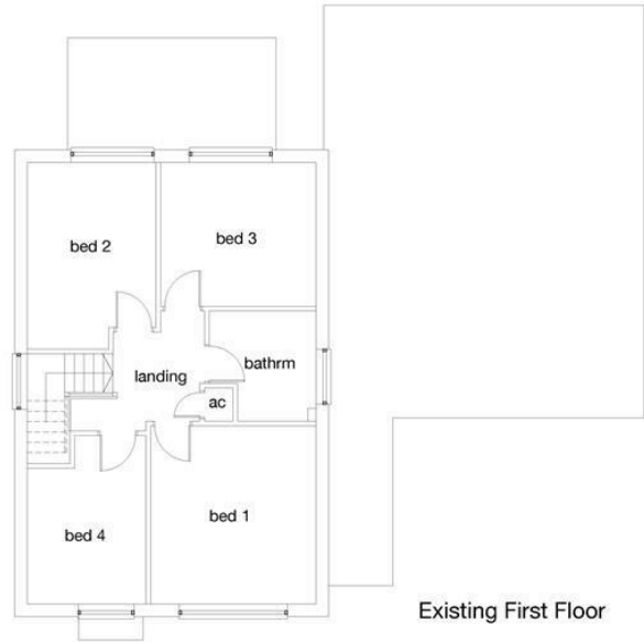
Existing First Floor

Schedule of Existing Areas: Ground Floor- 71.4m 2 First Floor - 60.0m 2 Total internal habitable area - 131.4m 2 Garage and Lobby - 41.4m 2 Workshop and Gym - 19.3m 2 Gross Internal Area - 192.1m 2