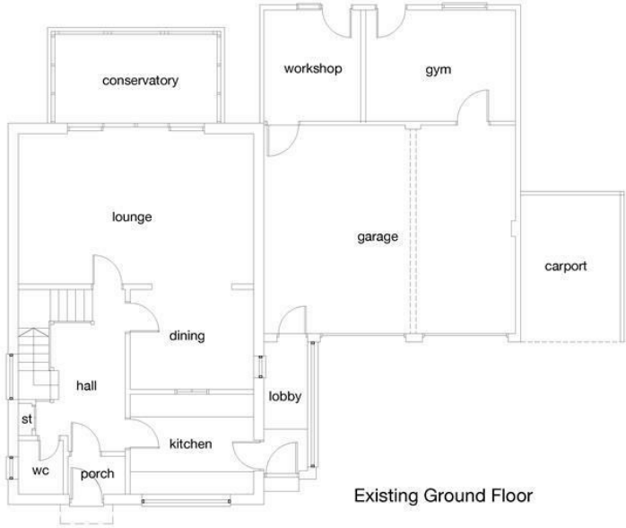
Existing Ground Floor