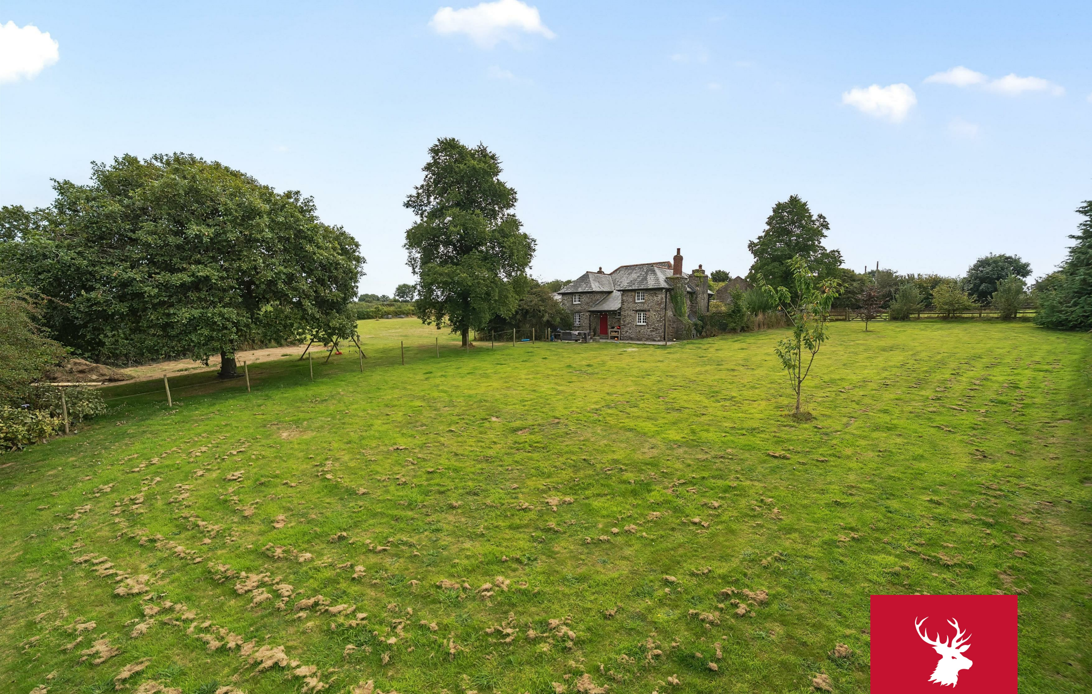
North Muchlarnick Old Farmhouse