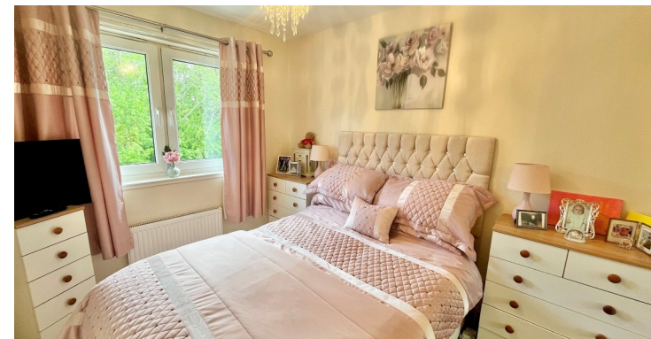
84 Haymarket Crescent