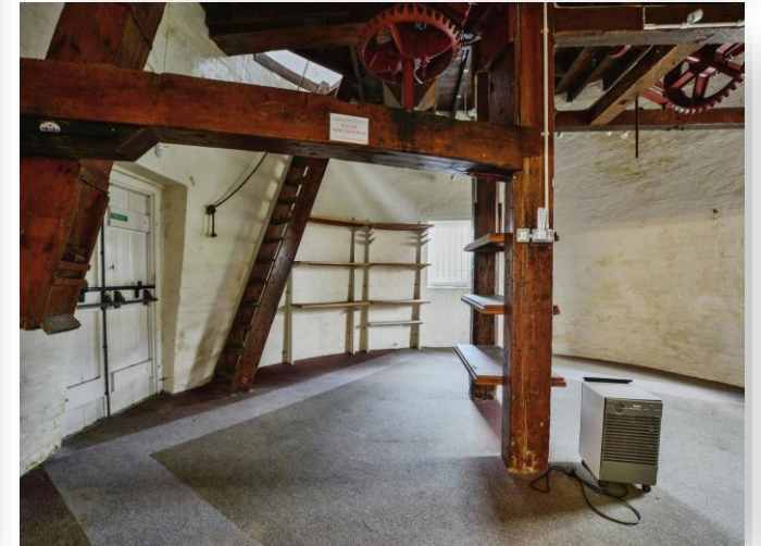
Addlethorpe Mill Mill Lane, Addlethorpe Skegness PE24 4TB