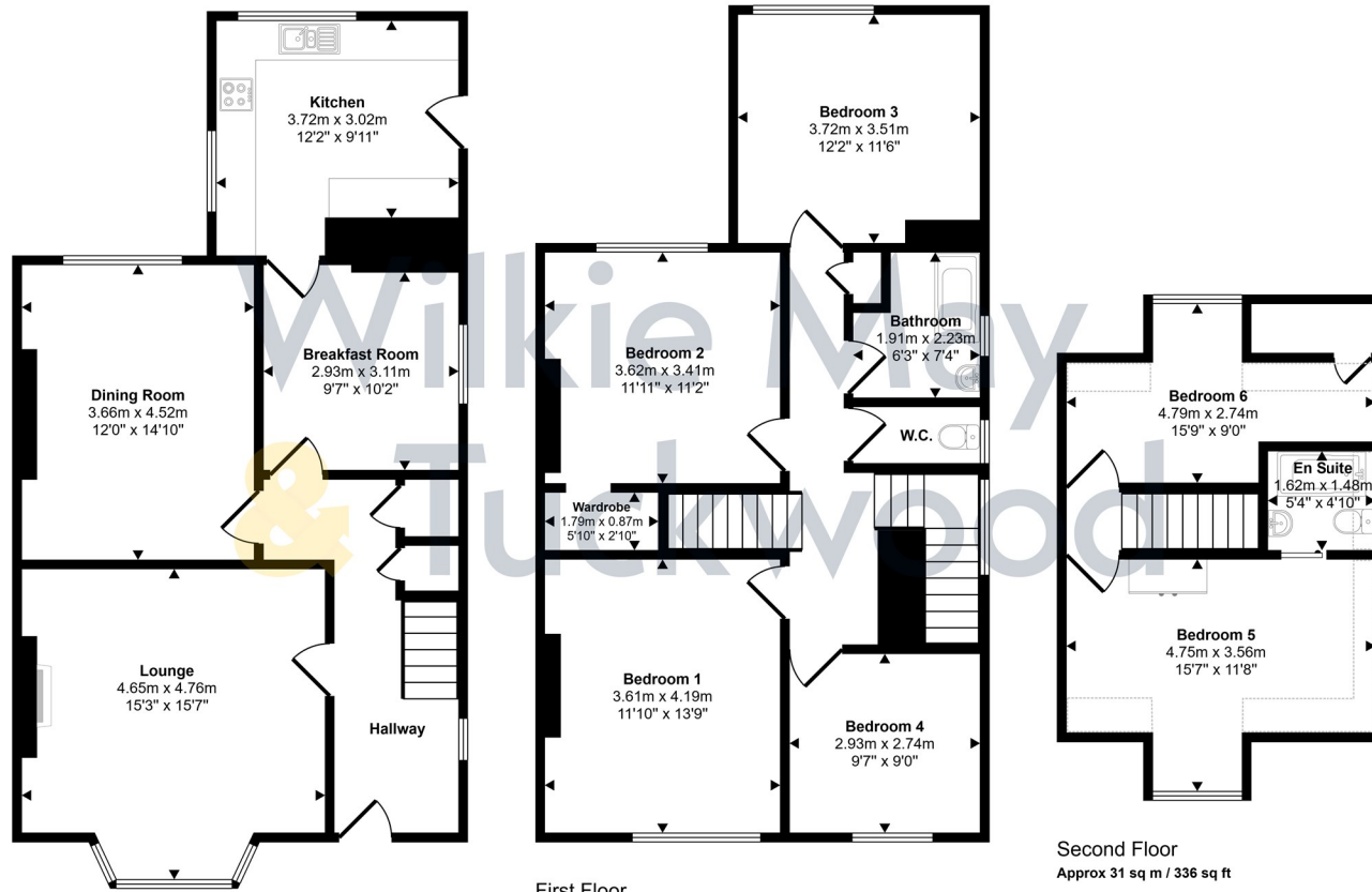
Ground Floor Approx 74 sq m / 800 sq ft

Approx Gross Internal Area 178 sq m / 1919 sq ft