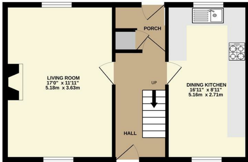
GROUND FLOOR 446 sq.ft. (41.5 sq.m.) approx.