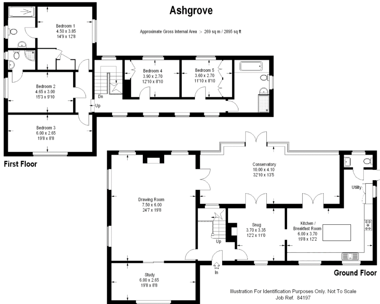
Illustration For Identification Purposes Only. Not To Scale Job Ref. 84197

Approximate Gross Internal Area :- 269 sq m / 2895 sq ft