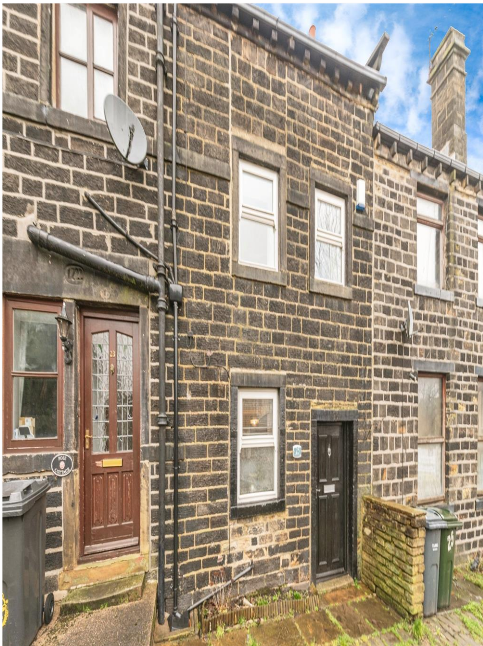
Henderson Place, Bradford BD6 1PL