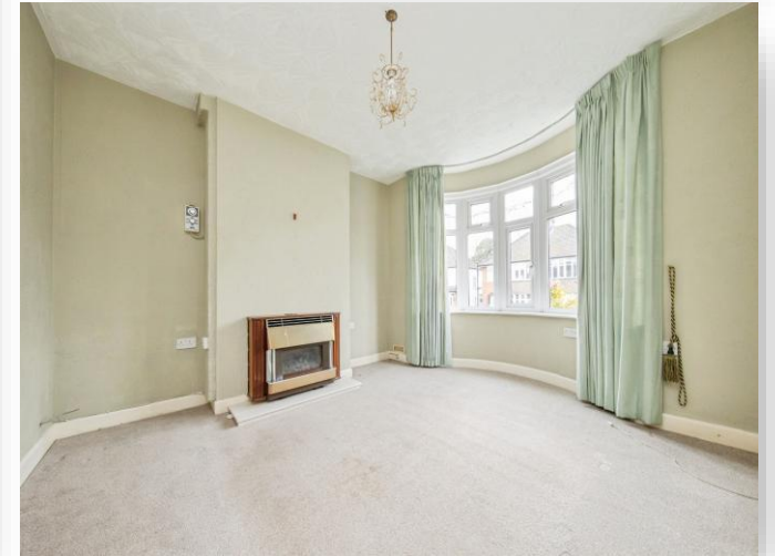
Oulton Road, Ipswich, IP3 0QD