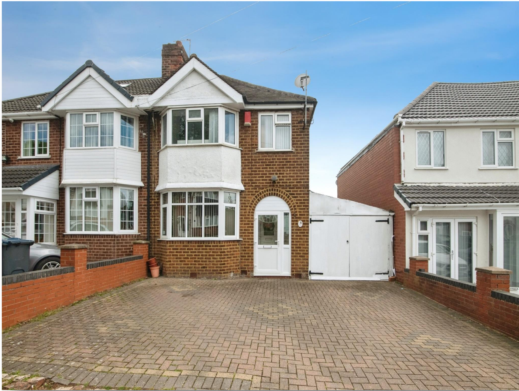
Coopers Road, Birmingham B20 2JX