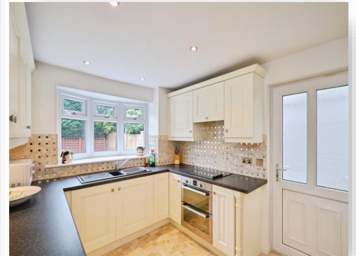
Porters Croft, Birmingham B17 8RU