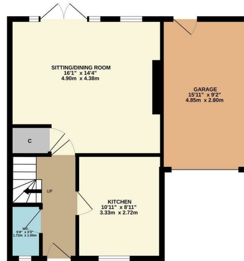
GROUND FLOOR 548 sq.ft. (50.9 sq.m.) approx.