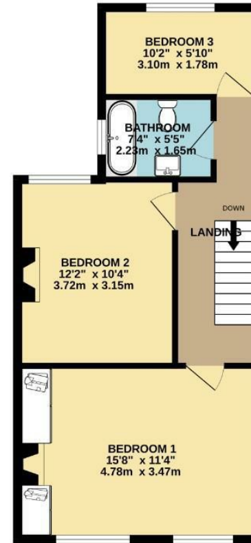
1ST FLOOR 484 sq.ft. (45.0 sq.m.) approx.