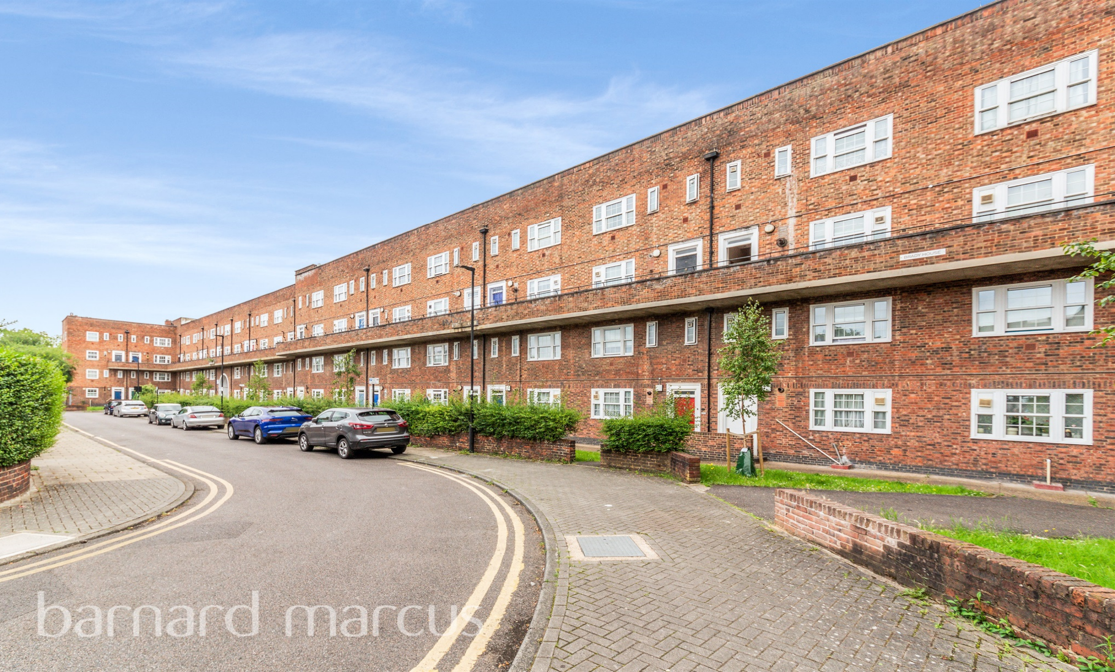
Brady House Worsopp Drive, London SW4 9RA

Not for marketing purposes INTERNAL USE ONLY