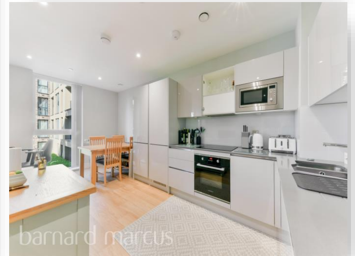
Orton House, Plough Lane, London SW17 0RF