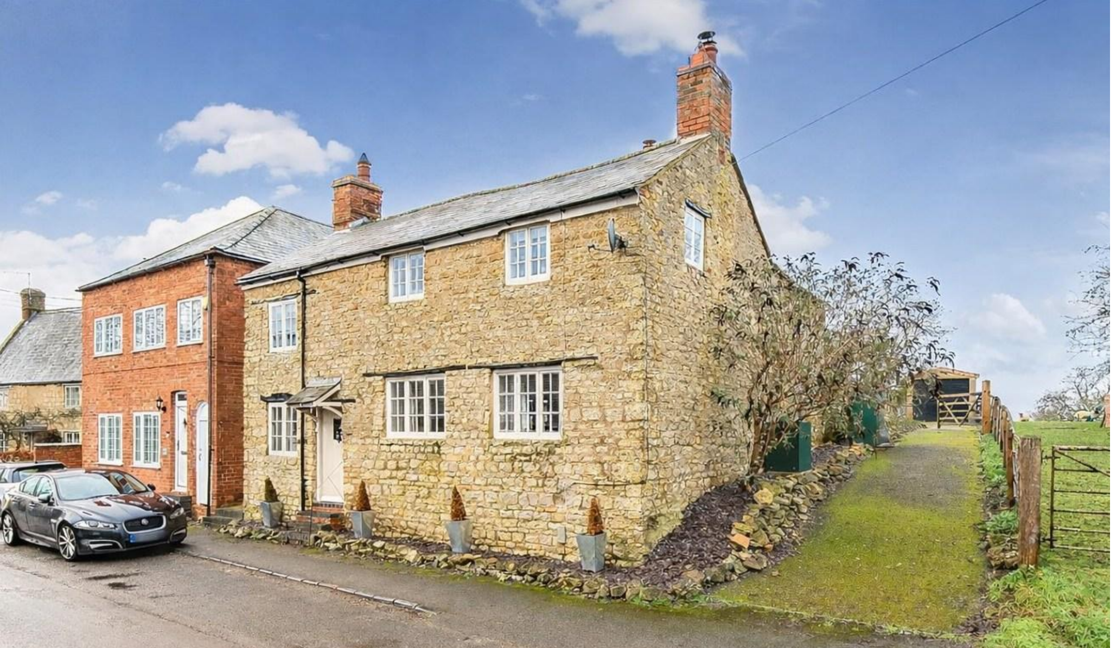
Mops Cottage, Caldecote, Northamptonshire, NN12 8AG