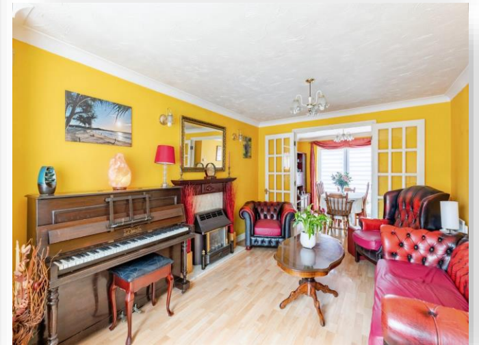
Ashton Grove, Wellingborough NN8 5ZA