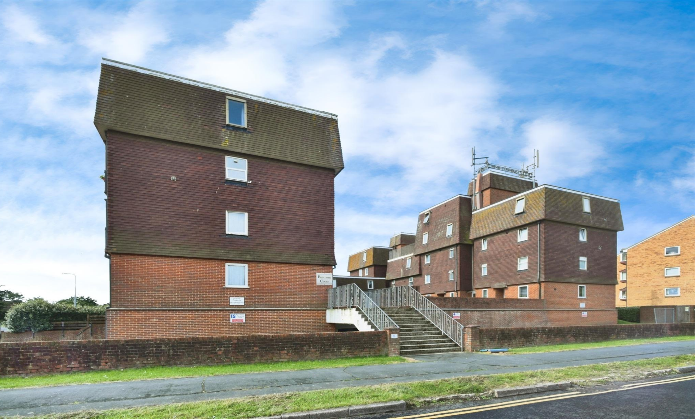
Balcombe Court Balcombe Road,Peacehaven BN10 7QW