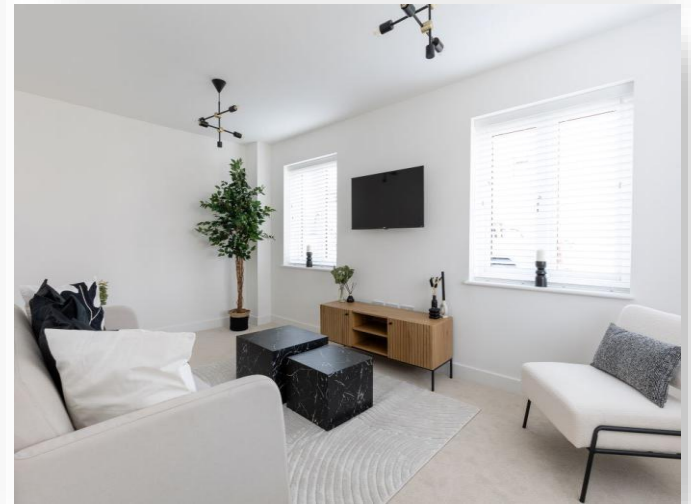
Woodside Meadows, Hartlepool, TS25 1DF