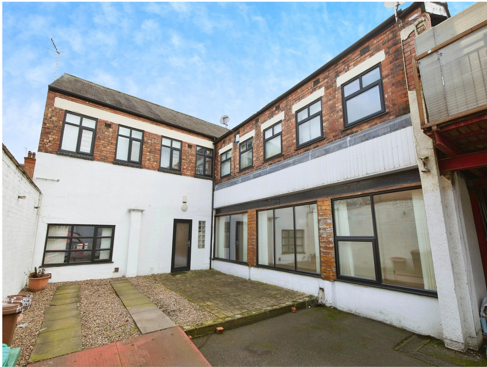
Haydn Court Hucknall Road, Nottingham NG5 1FG