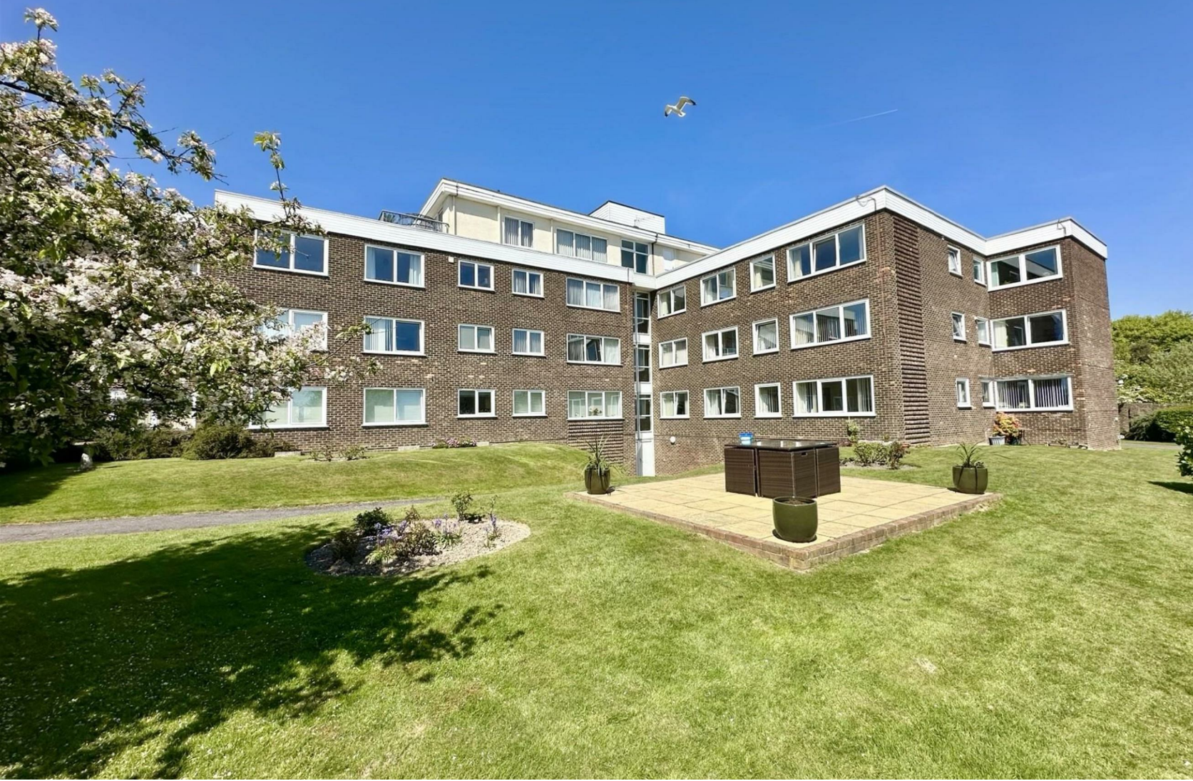
Flat 18 Dorset House 6 Hastings Road, Bexhill-On-Sea, TN40 2FR