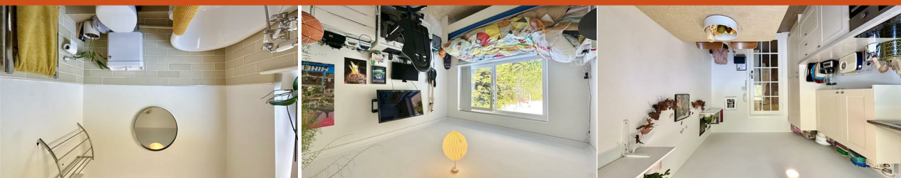
Flat 18 Dorset House 6 Hastings Road, Bexhill-On-Sea, TN40 2FR