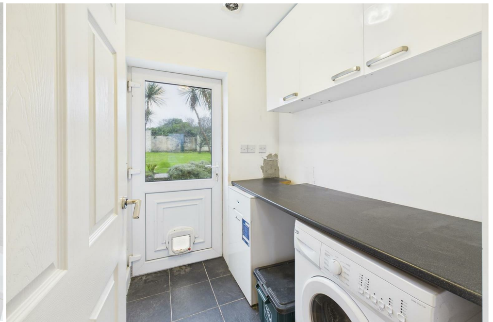
Cledma Bank, St. Erth, TR27 6HH