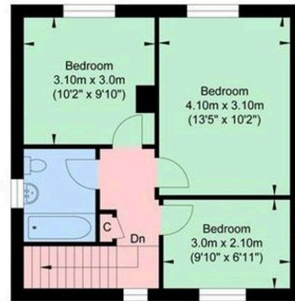
First Floor Approximate Floor Area 434.0 sq ft (40.32 sq m)