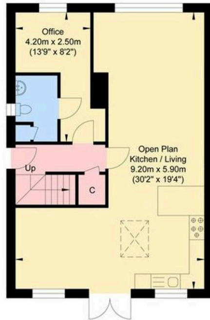
Ground Floor Approximate Floor Area 623.87 sq ft (57.96 sq m)