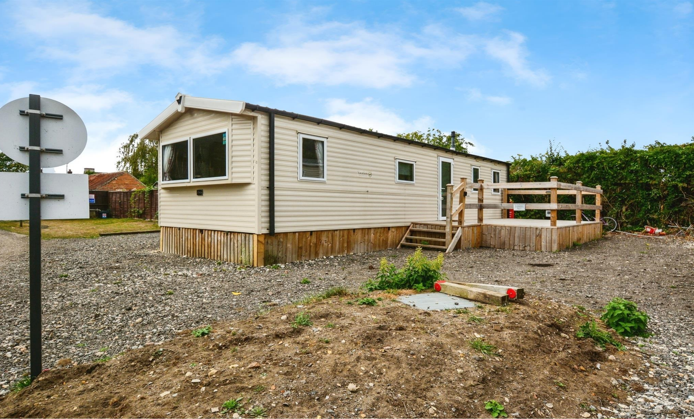
Red Lion Holiday Lets Fen Road, East Kirkby Spilsby PE23 4DB