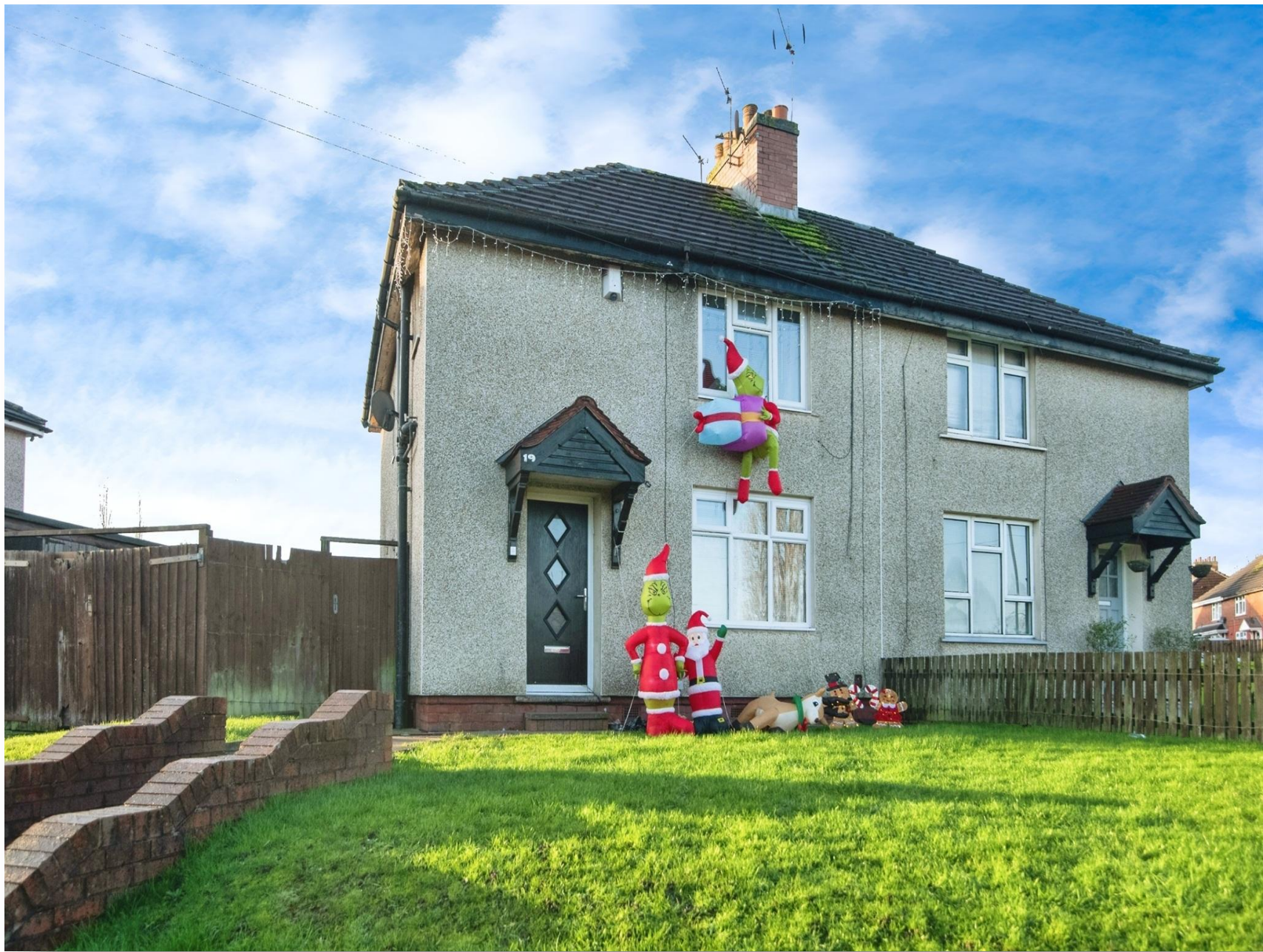
Ivy Road,Dudley DY1 3NR