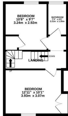
1ST FLOOR 345 sq.ft. (32.0 sq.m.) approx.