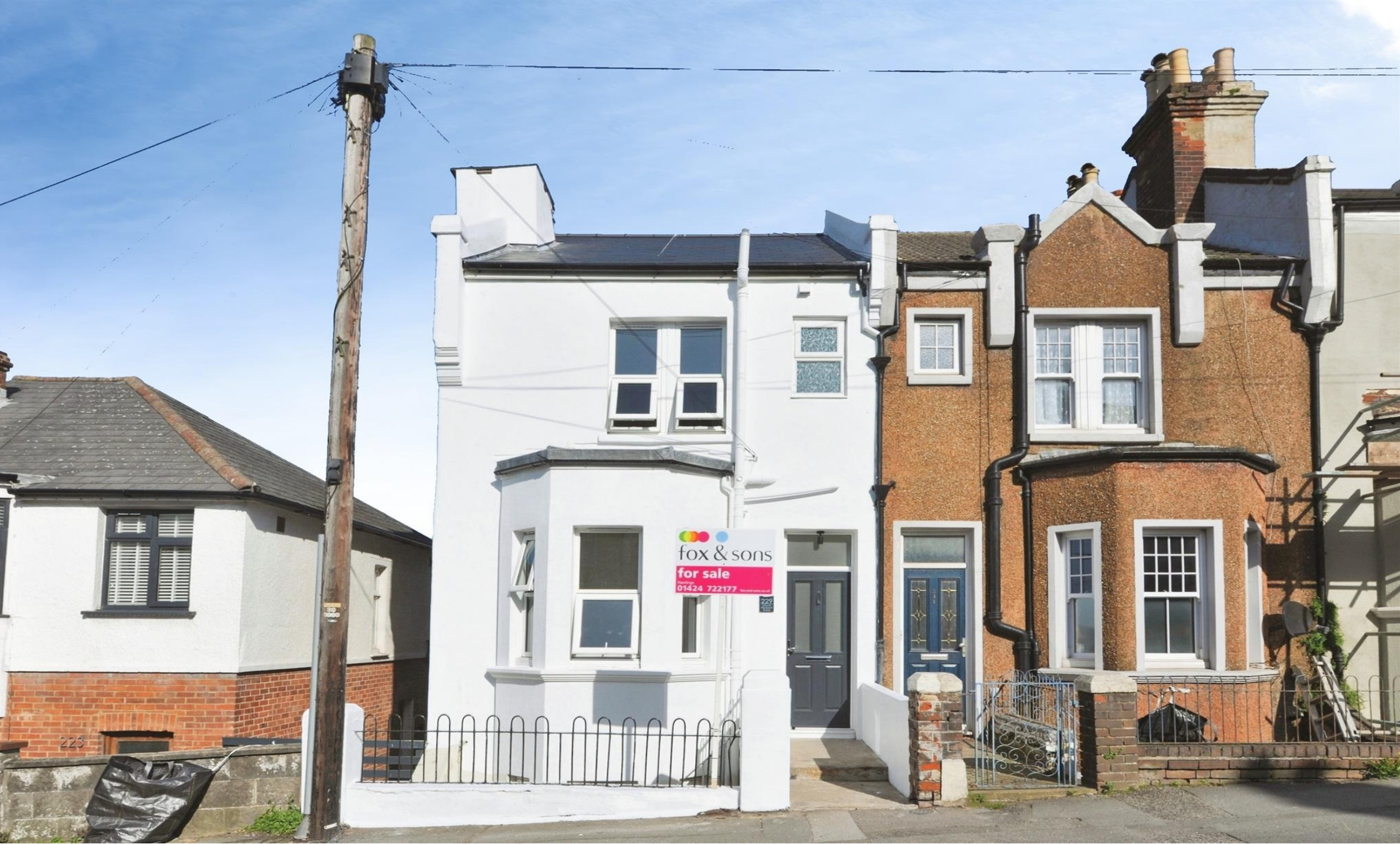
Mount Pleasant Road, Hastings TN34 3SS