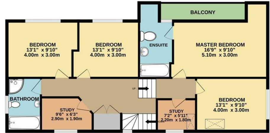
TOTAL FLOOR AREA : 2045 sq.ft. (190.0 sq.m.) approx.

Whilst every attempt has been made to ensure the accuracy of the floorplan contained here, measurements of doors, windows, rooms and any other items are approximate and no responsibility is taken for any error, omission or mis-statement. This plan is for illustrative purposes only and should be used as such by any prospective purchaser. The services, systems and appliances shown have not been tested and no guarantee as to their operability or efficiency can be given. Made with Metropix ©2024