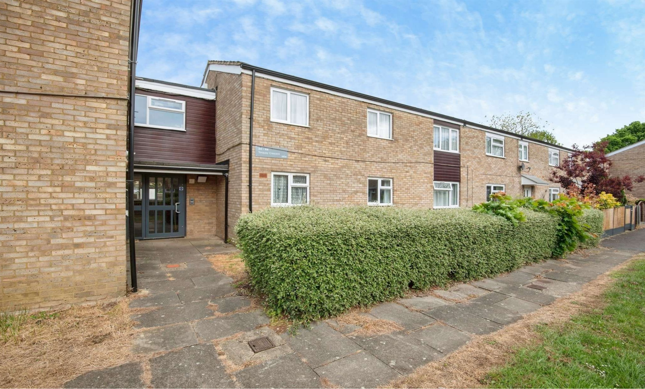
Torquay Crescent, Stevenage, SG1 2RS