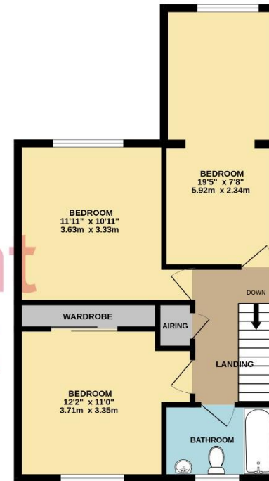
1ST FLOOR 568 sq.ft. (52.7 sq.m.) approx.