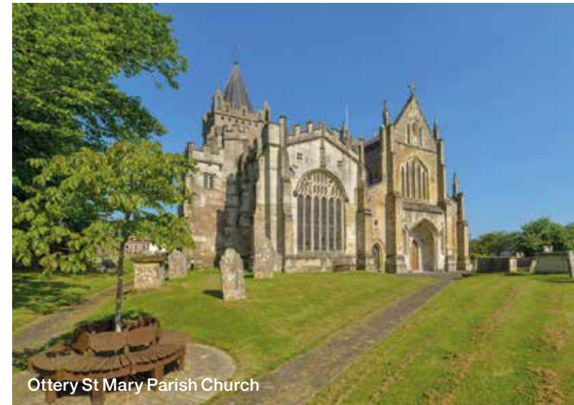
Ottery St Mary Parish Church