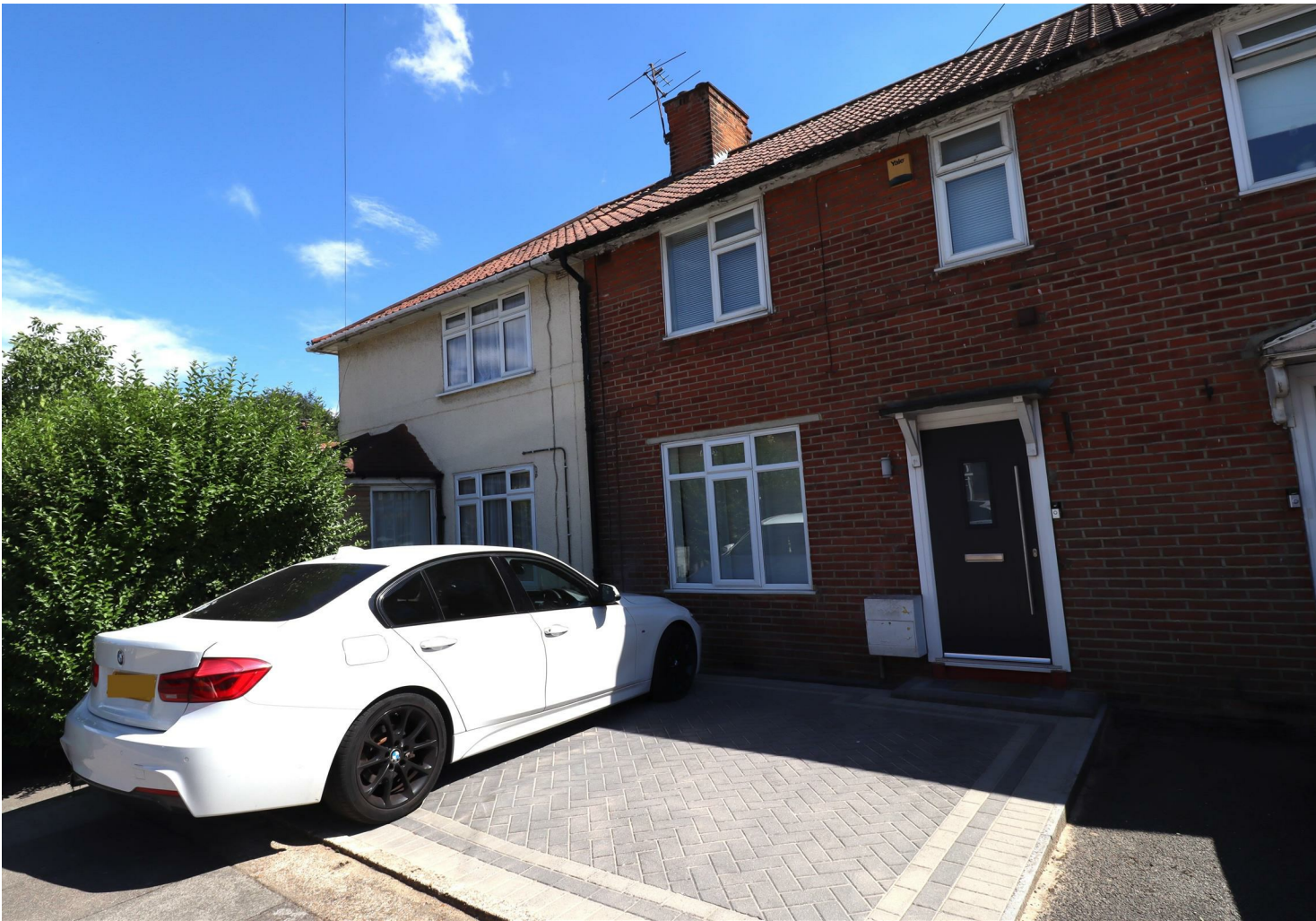
Abbots Road, Edgware, HA8 0RG

Whilst every attempt has been made to ensure the accuracy of the floor plan contained here, measurements of doors, windows, rooms and any other items are approximate and no responsibility is taken for any error, omission, or mis-statement. This plan is for illustrative purposes only and should be used as such by any prospective purchaser. The services, systems and appliances shown have not been tested and no guarantee as to their operability or efficiency can be given Made with Metropix ©2017