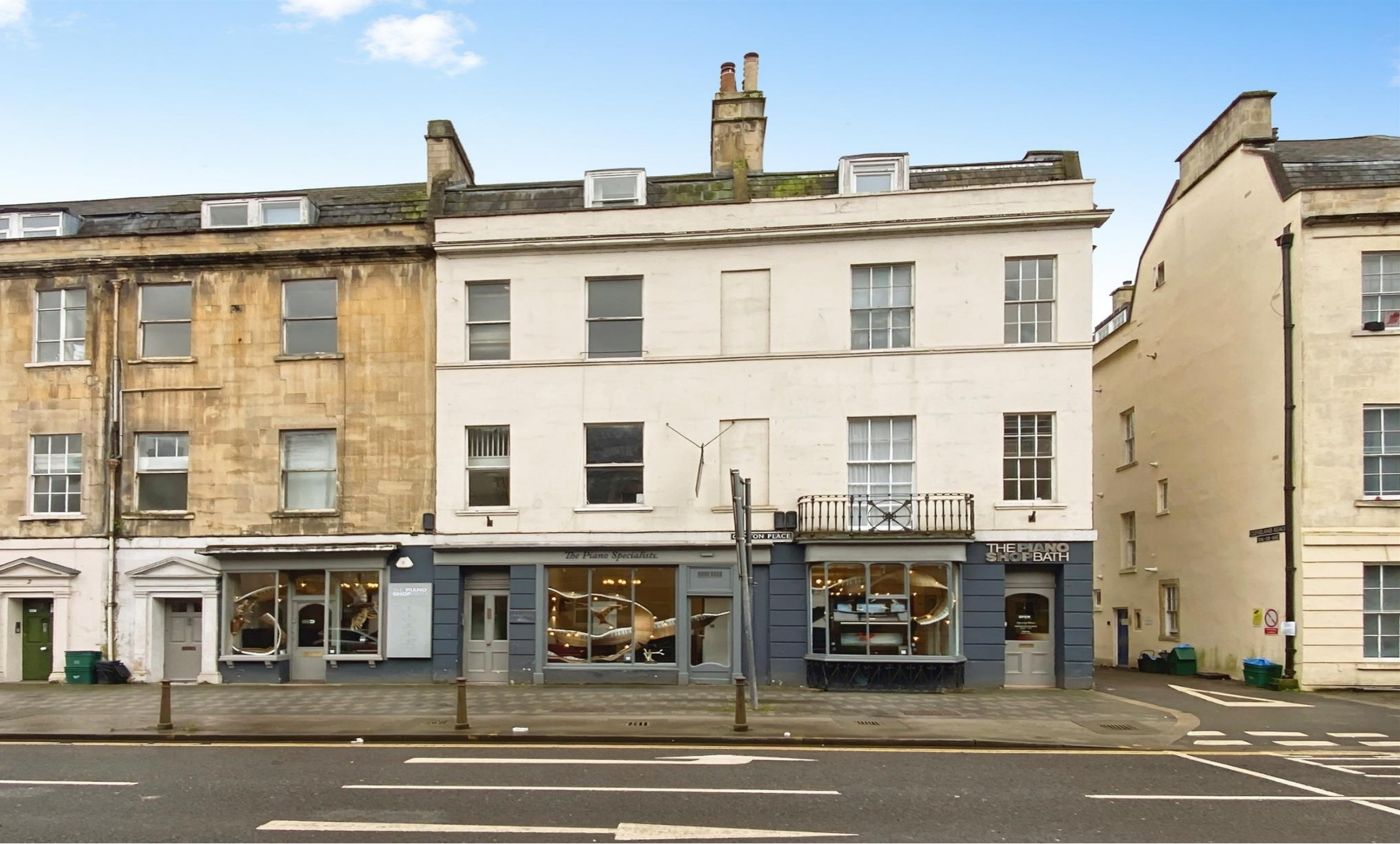
Canton Place, Bath, BA1 6AA