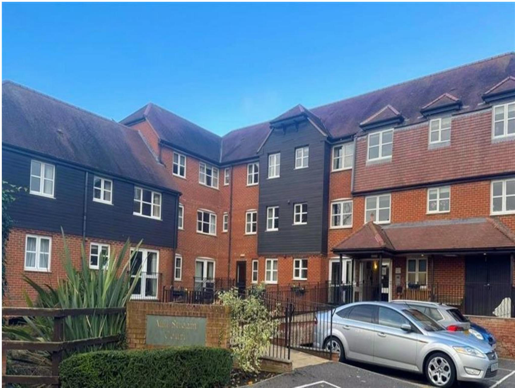
Mill Stream Court, Abingdon, OX14 5XA