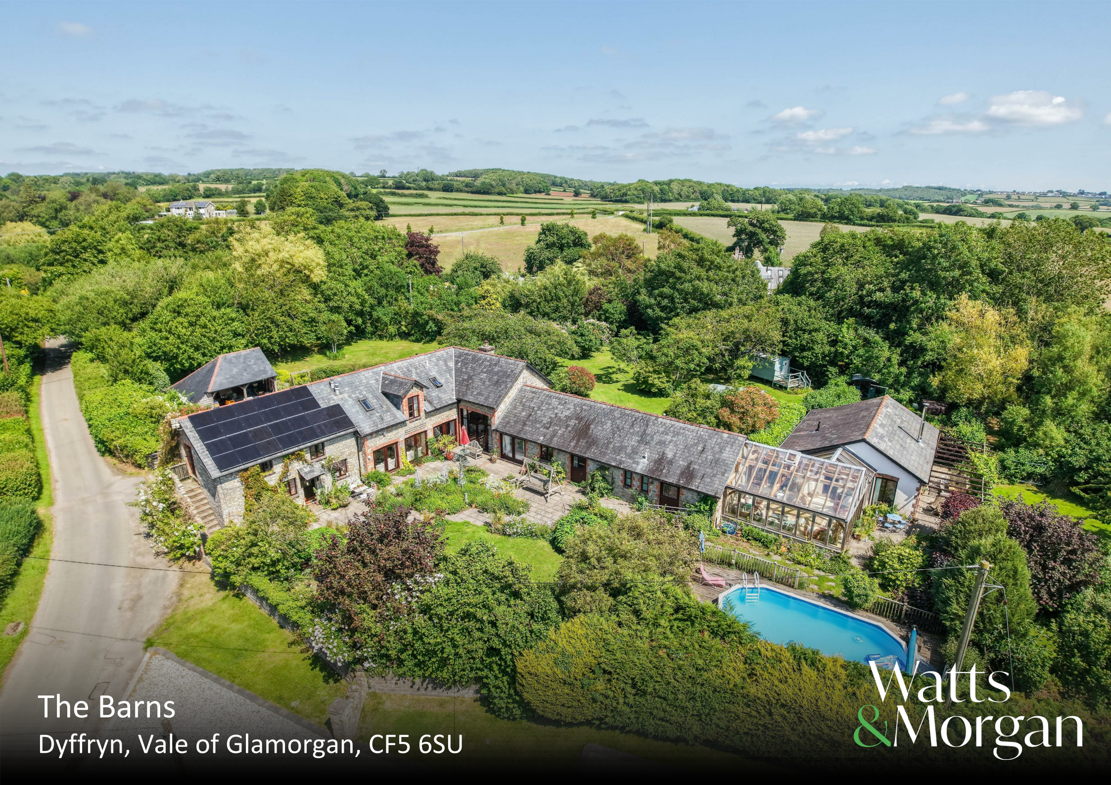
The Barns Dyffryn, Vale of Glamorgan, CF5 6SU