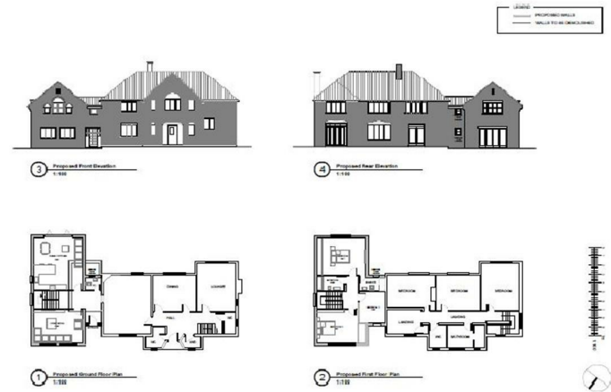
Proposed Plans and Elevations