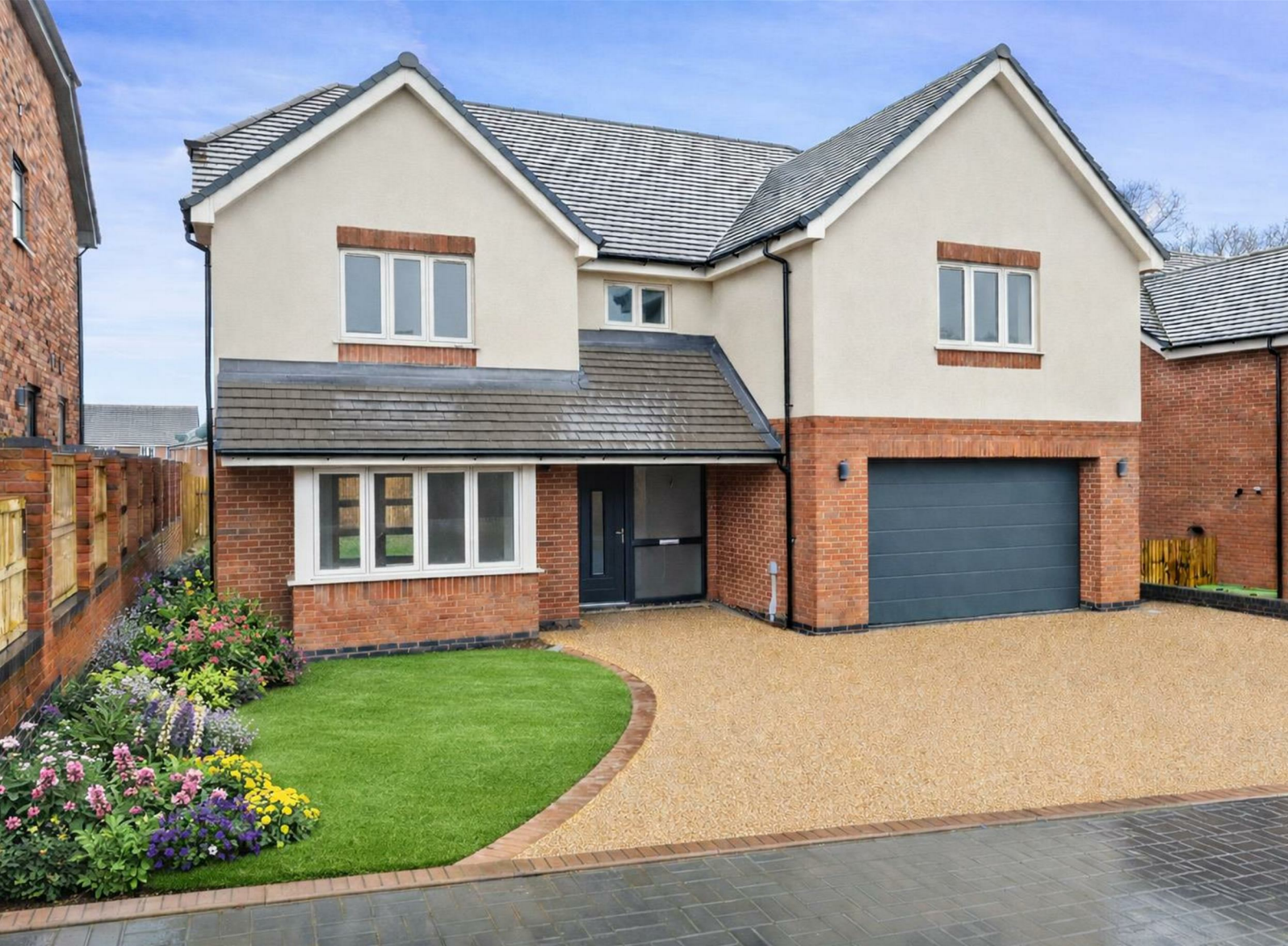
Pumphouse Lane, Redditch