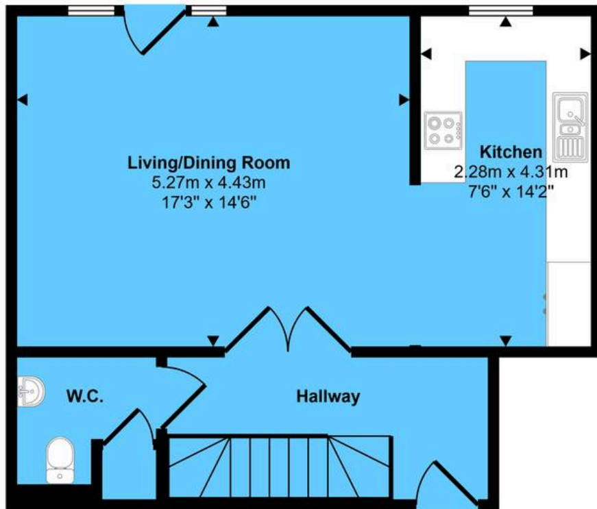
Floor 1 Approx 47 sq m / 502 sq ft

Approx Gross Internal Area 96 sq m / 1036 sq ft