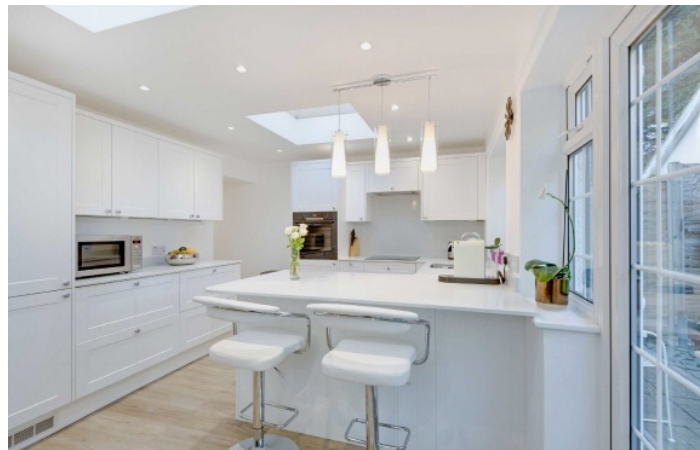
Perivale Lane, UB6