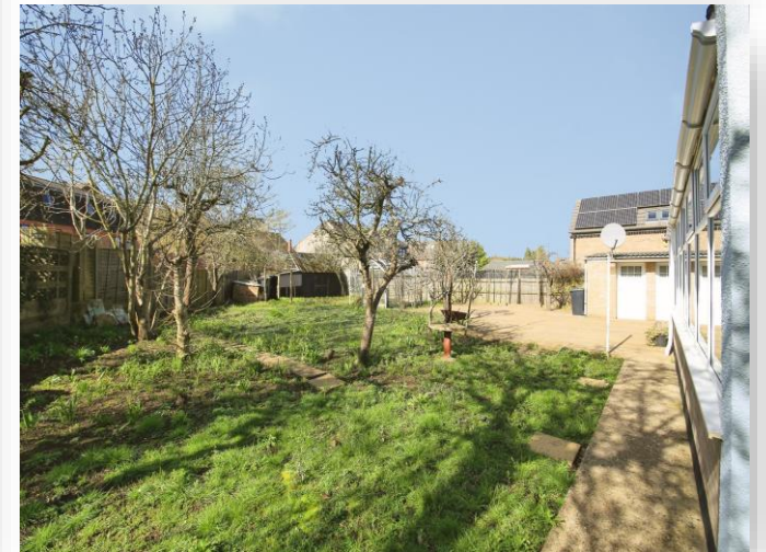
Ceglie ,Springfield,Peterborough ,PE2 8BU