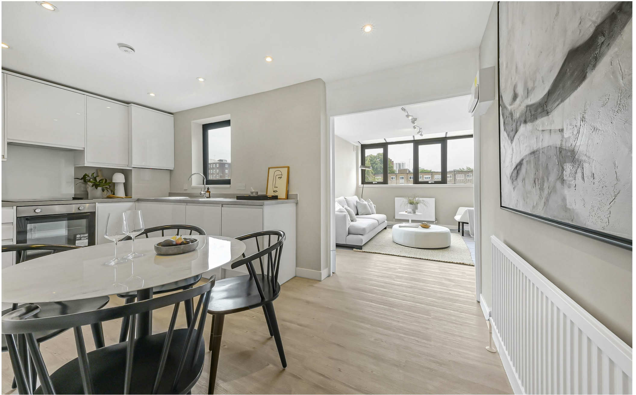
Goldhurst Terrace NW6