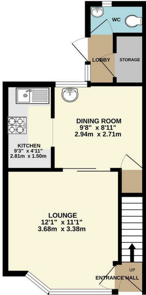
GROUND FLOOR 356 sq.ft. (33.1 sq.m.) approx.