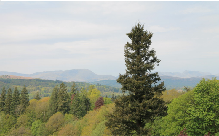
Lakeland fell views