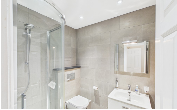
En suite shower room