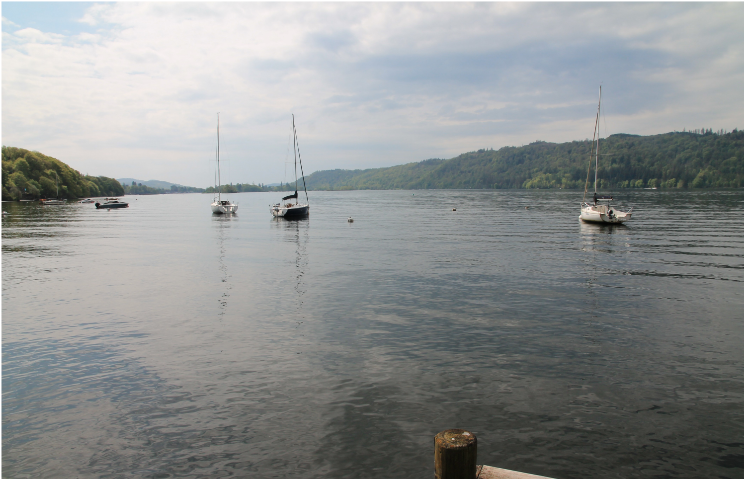
Outlook from jetty