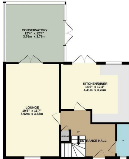
GROUND FLOOR 654 sq.ft. (60.7 sq.m.) approx.