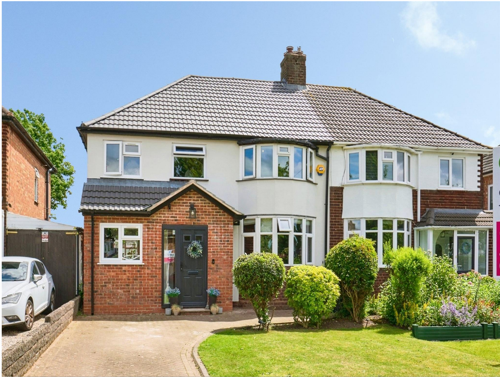
Kingswood Drive, Sutton Coldfield B74 2AN