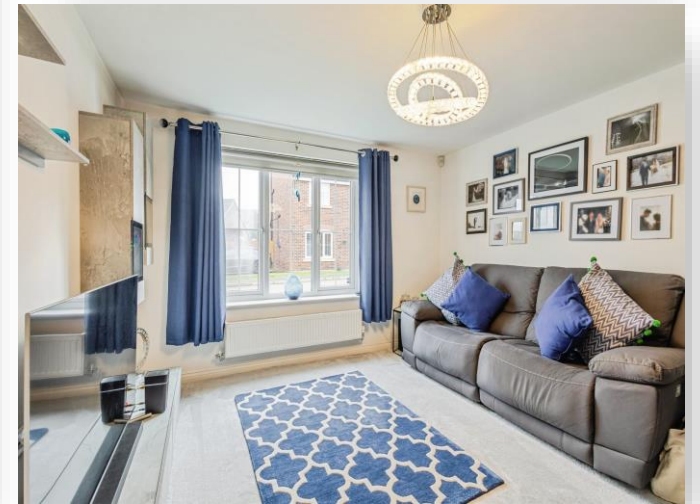
Harlequin Close, Northampton NN4 9AB