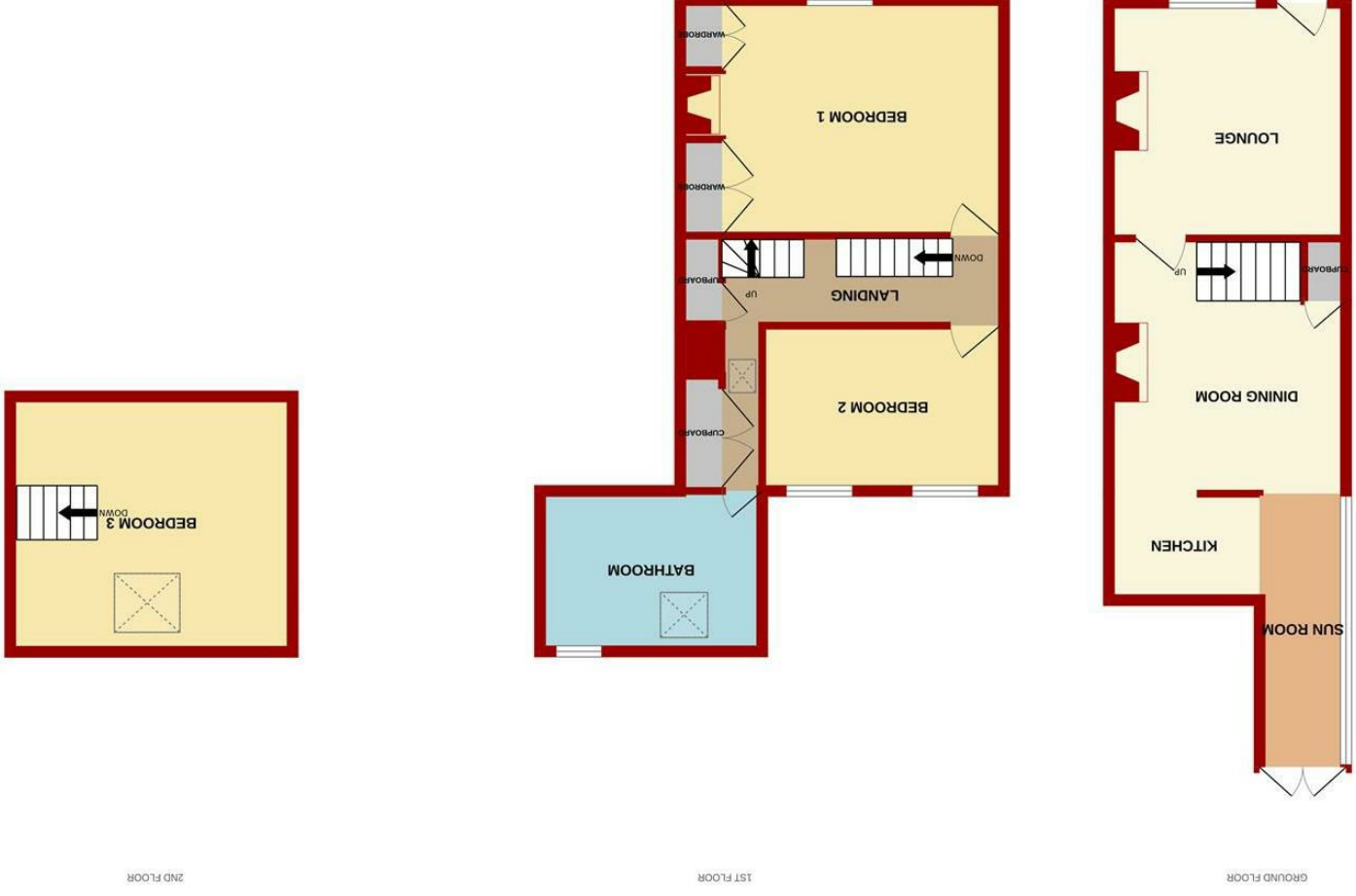
Measurements are approximate. Not to scale. Illustrative purposes only. Made with Metropix ©2025