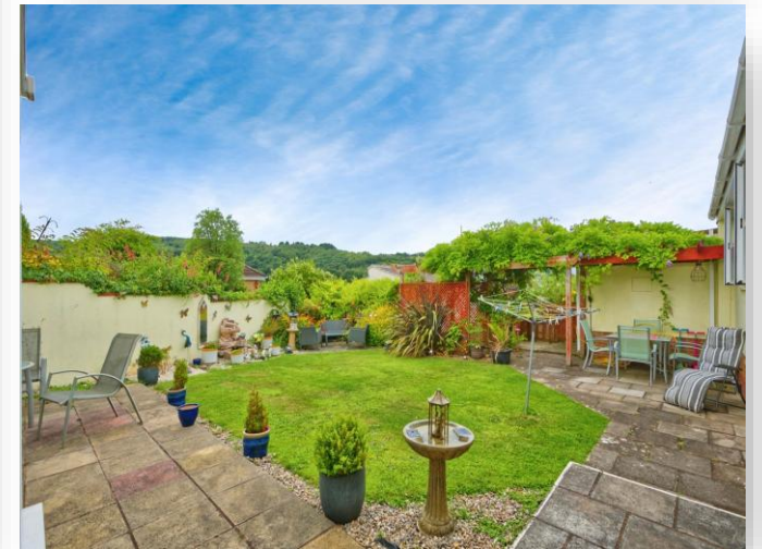
Old Farm Road, Minehead TA24 8AS